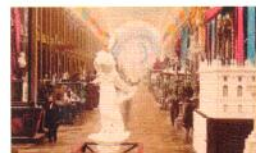
The Great London Exhibition of 1862 will be recalled in February

▶ Presenting the latest research from underwater excavation in and around Arles. www.louvre.fr