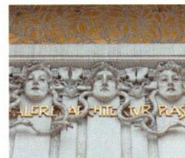
Demonstrating the decorative at the IIC's September conference: the Secession Building, Vienna

▶ Fundraising and audience development are just a few of the topics on