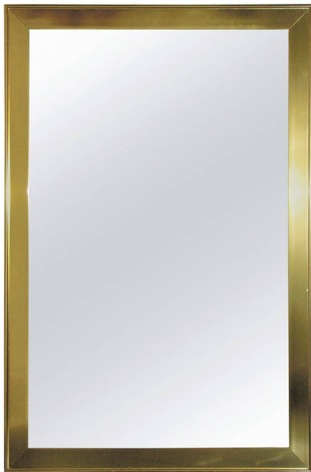
Italian Brass Frame Mid-Century Wall Hanging Mirror from Dasberg Antiques, $1,200, 1stdibs.com

straightforward as the simple interior frame of the fireplace. Also unusually modern: The mirror sits directly on the fireplace mantel. Not surprisingly, a 20th-century piece can serve well. Italian Brass Frame Mid-Century Wall Hanging Mirror from Dasberg Antiques, $1,200, 1stdibs.com