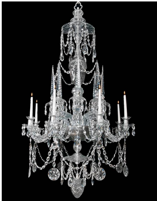
18th-Century Continental Cut Glass Chandelier, $300,000, Fileman Antiques, 44-19-0381-3229

place a cut-glass chandelier so that the light is reflected in a mirror.” 18th-Century Continental Cut Glass Chandelier, $300,000, Fileman Antiques, 44-19-0381-3229