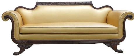
Duncan Phyfe Style Empire Sofa from Harveys on Beverly, $9,700, 1stdibs.com