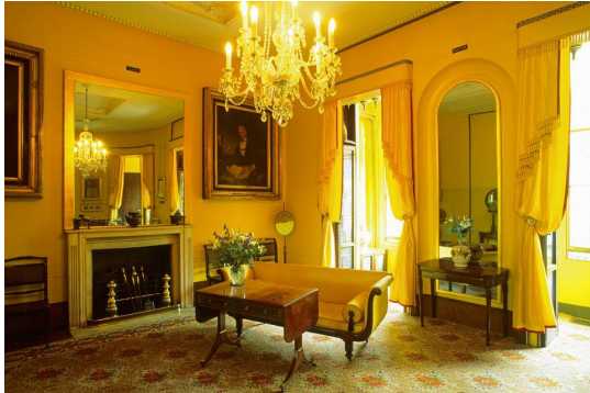
LEMON ZEST | The yellow of Sir John Soane's London drawing room was intended to recreate the glow of Mediterranean light.