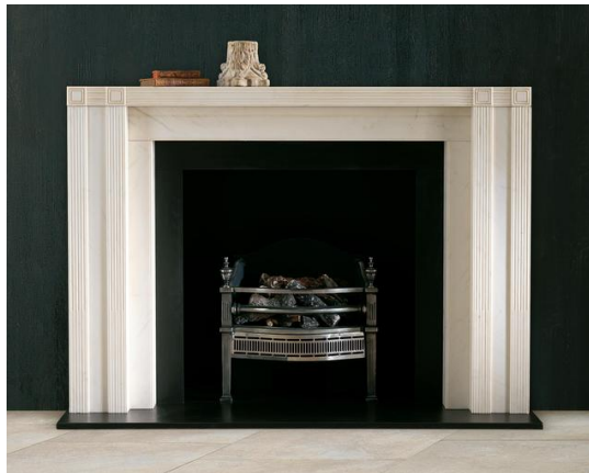
Soane Pattern VI Mantel, $12,500, 646-840-0609