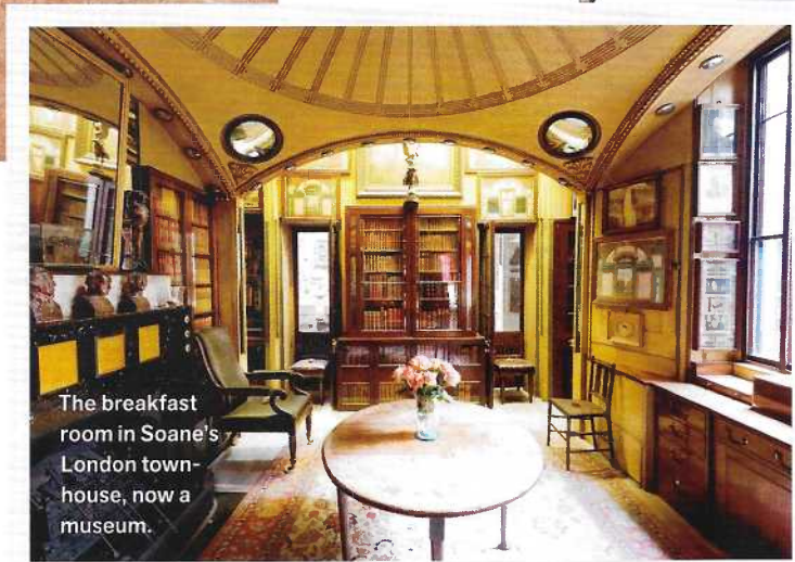
The breakfast room in Soane's London townhouse, now a museum.