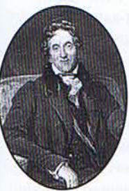
Could you win this cartoon by a leading artist inspired by Soane (above)?

LEADING figures in art and design, such as Damien Hirst, Vivienne Westwood and Ronald Searle, have donated new works to an exhibition at the Sir John Soane's Museum, Lincoln's Inn Fields, London WC2, in which visitors can enter a 'blind sale' to own one of the pieces. The 191 artists were invited to create a work celebrating the museum dedicated to the 19th-century neo-Classical architect, the linking theme being that pieces must be inspired by him. The exhibition, 'Inspired by Soane' (September 10–October 1), will