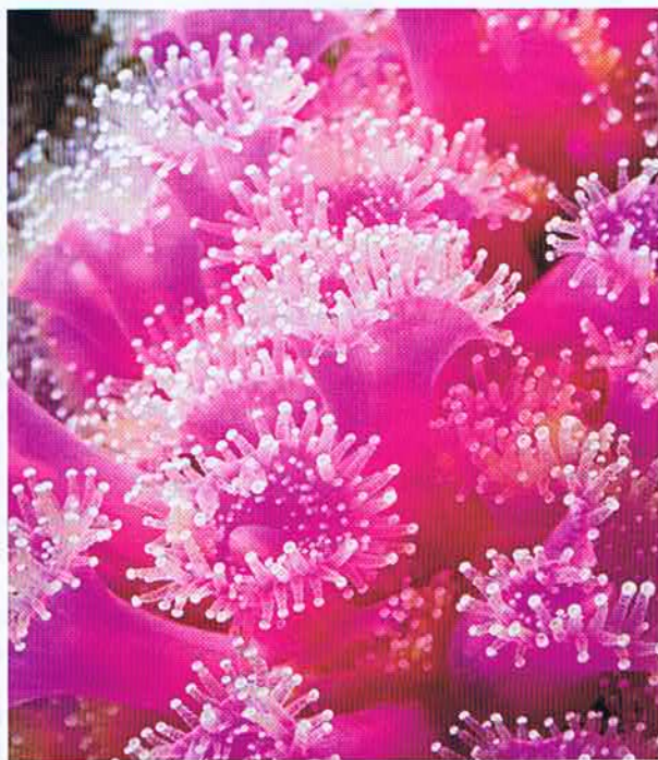
Jewel anemones blooming off the Lizard, Cornwall

Three other sites—Lune Deep, Prawle Point to Start Point and Dogger Bank, which has also been identified as an area for potential wind-farm development—are also being considered. The consultation period ends on December 12.